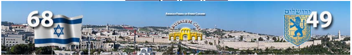
Parashat Shemot / פרשת שמות Candle Lighting in Jerusalem 4:22 PM, January 20, 2017, 22 Tevet 5777