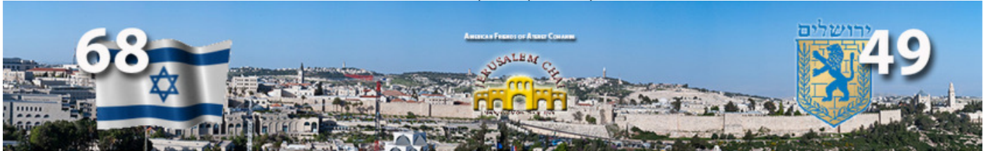
(US)Parashat Emor / פרשת אמור (Israel) Parashat Behar / פרשת בהר Candle Lighting in Jerusalem 6:52 PM, May 20, 2016 Iyyar 12, 5776 - 28 Days in the Omer