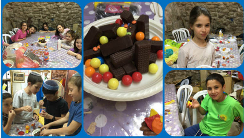
larger picture click here