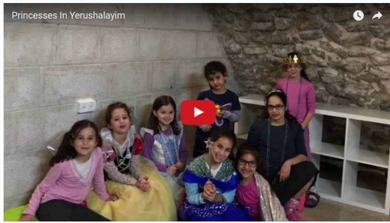
Getting Ready for Lag B'Omer