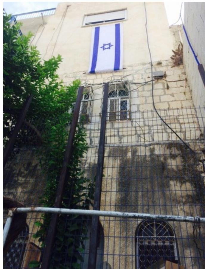
A key Jewish community in eastern Jerusalem – practically right under the Temple Mount, to be precise – celebrated its third milestone in six months on Monday: The return of the old Yemenite Great Synagogue in the Shiloach village to Jewish hands after nearly 80 years.