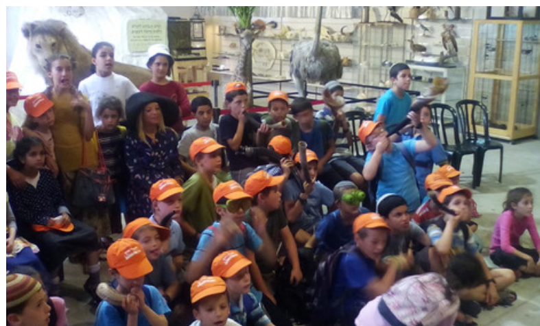
Children visit the Natural History Museum in Beit Shemesh