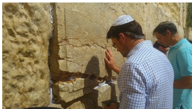
at the Kotel