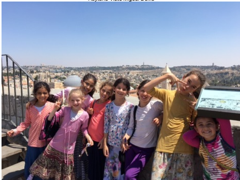
Our Girls on Top of the World, Migdal David

First ever PINAT CHAM in the Old City for all security personnel and Policemen. Help us establish a critically needed this most needed rest and refreshment spot at the entrance to Beit Wittenberg.. They protect us. Let's show them our appreciation. (projected cost $42,000)