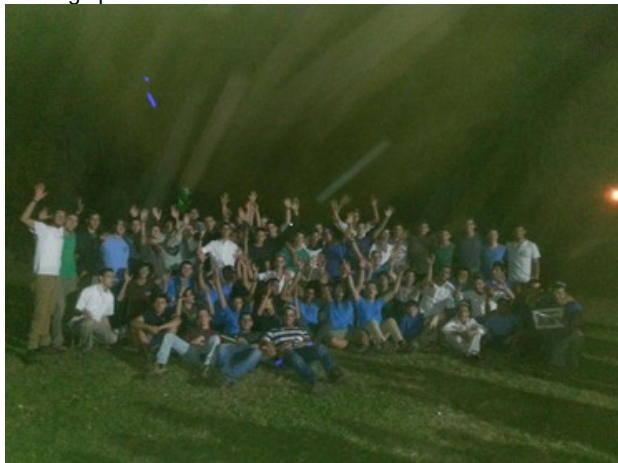
The residents of Keshet warmly welcomed all the Ateret Cohanim youth with open arms and love, and showed a tremendous amount of empathy with the youth.