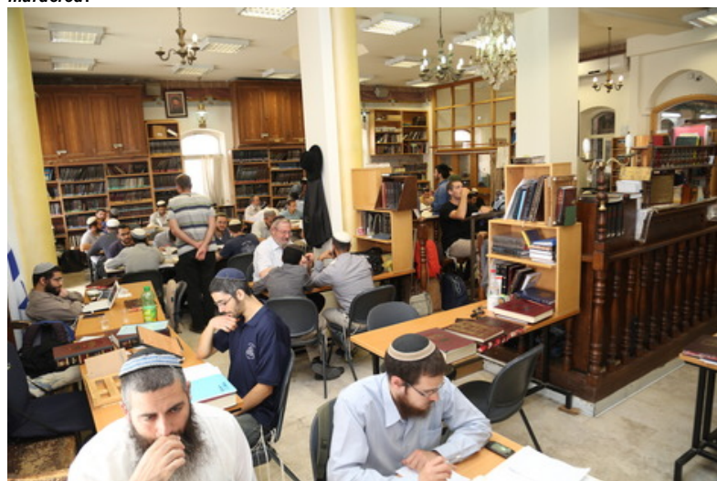
Yeshiva Ateret Yerushalayim