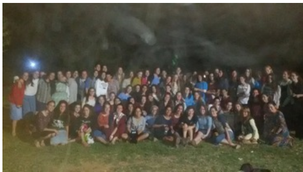
The youth who showed an enormous amount of emunah (faith), strength and resilience during the communal "shiva" of Rabbi Nechemiah Lavi hy'd, that was held in the Old City, forged a unique bond with each other during that period and so it was decided with Ateret Cohanim to have this special Shabbat of bonding up north.