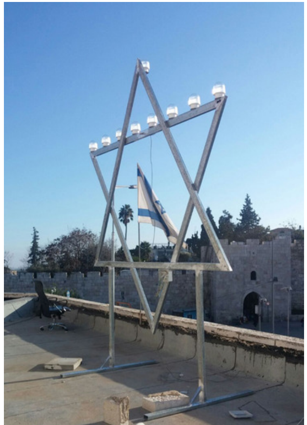
Our New Chanukiah at Flowers Gate

We literally stand alone, as an independent sovereign nation, recognizing the united city of Jerusalem as our capital city. Not even so-called "friends" like Britain, Australia, France and America recognize united Jerusalem as our capital.